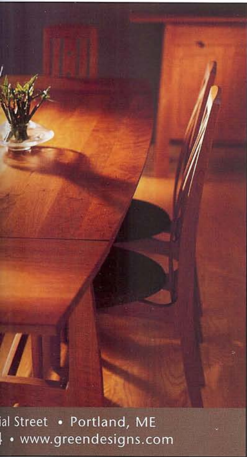
al Street • Portland, ME • www.greendesigns.com